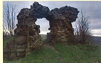
Howley Hall Ruins