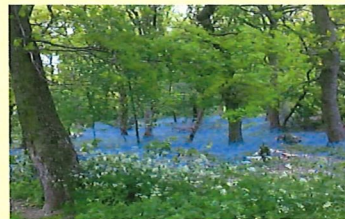
Clark Springs Wood